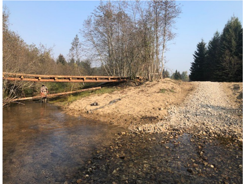
Hard crossing, ATV bridge