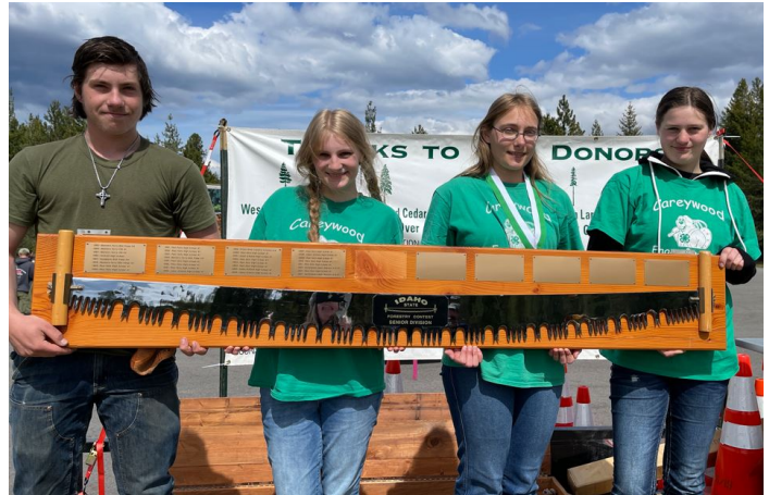
2022 First Place Team - Careywood Eager Beavers

The Forestry Contest has continuously grown since the program began with over 1000 in attendance at the programs pre-pandemic peak in 2019. With this growth and due to wind and storm damage at the Delay Farms the hard decision was made to relocate the contest to Farragut State Park for the 2022 event. The contest requires over 500 hours of prep work to manage registration, volunteer coordination as well as to prepare and set up the courses. There were additional exciting changes that took place this year as the University of Idaho college of Natural Resources began offering scholarships to top 3 individual and team winners in the Senior category. 2022 brought new teams from throughout the state to the contest as well as return of many FFA teams. An additional feature of the event this year was the Job Fair attended by both state entities and private industry members. We look forward to this aspect of the event continuing to grow in the coming years. The Forestry Contest has seen some of its largest changes in the past four years and though change can present challenges it has also resulted in great successes as we get to the root of the event to engage students in Idaho related to one of our greatest resources, trees!