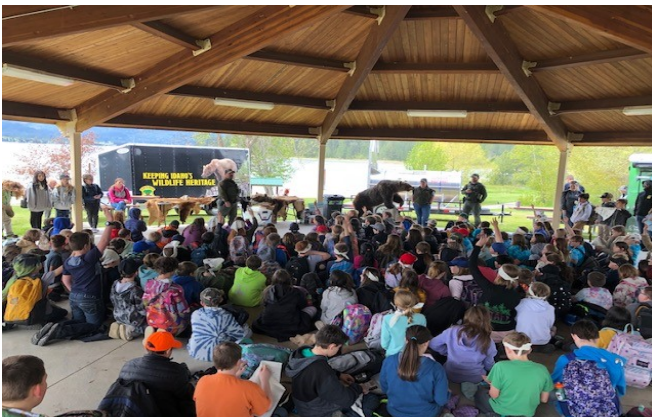
Water Festival - Bear Aware Presentation

The annual Pend Oreille Water Festival was back in full swing for the May event. Our setup team took one for the team and erected tents and setup stations in downpours but the weather held off for the event itself. The students and teachers were excited to once again be able to attend in person hands on educational events. This years lunch time show was presented by Idaho Fish & Game and focused on "Bear Aware" safety and education. Once again the pre and post festival tests showed a significant knowledge gain by students across the board. Our High School chaperones were phenomenal this year and contributed to one of our best events yet!