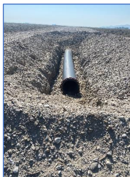
NRCS funded irrigation ditch to pipeline conversion project