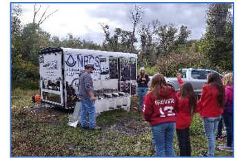
6 th Grade Natural Resources Tour