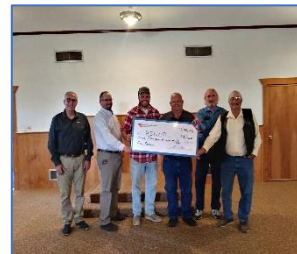
District Board receiving grant award