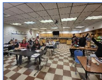
Forest Education Grant Activity