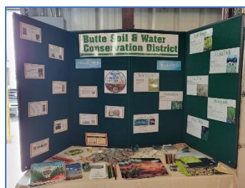
Educational County Fair Display