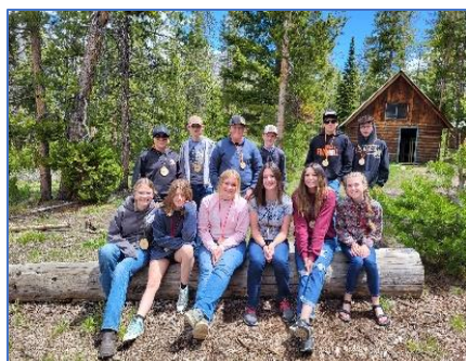
Natural Resource Camp campers