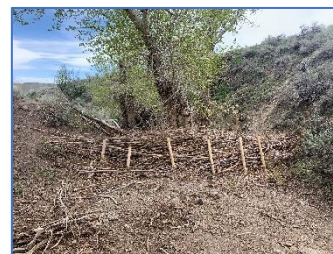
NRCS Beaver Dam Analog Installation