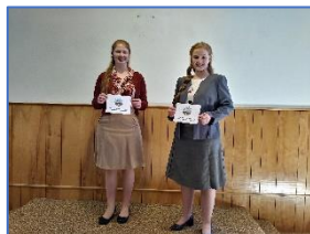
Speech Contest Winners