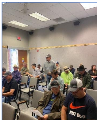
Local working group public meeting

The NRCS obtained 45 new contracts , benefiting 15,811 acres and provided $1.9 million financial assistance for landowners. Contracts were obtained in the general EQIP, general CSP, and Regional Conservation Partnership Program-EQIP programs.