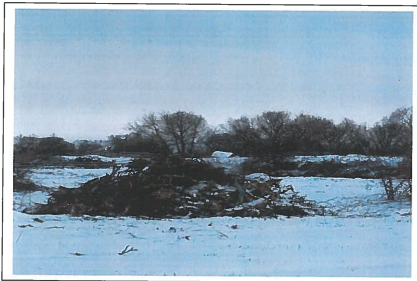
Slash pile of Russian Olives waiting to be burned next year.