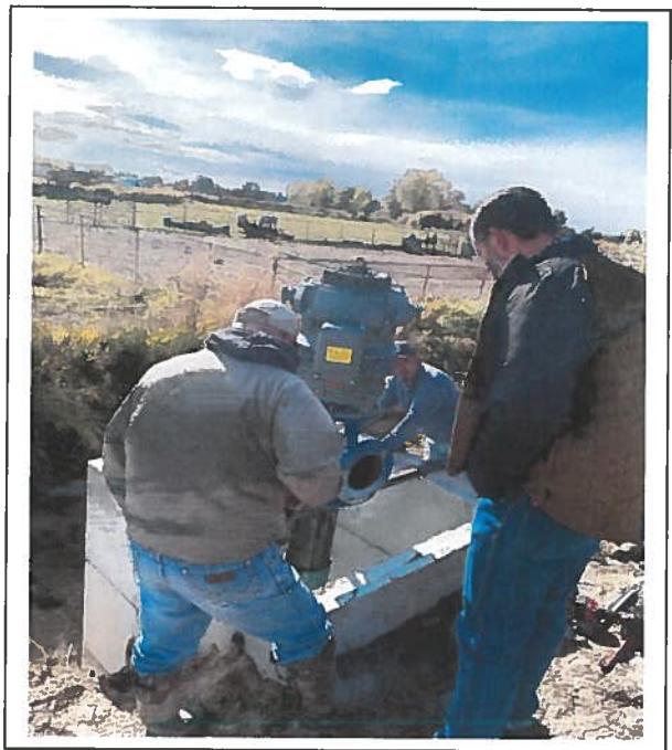
Installing Pump and Wheel Lines on this previously flood irrigated field is a huge improvement !