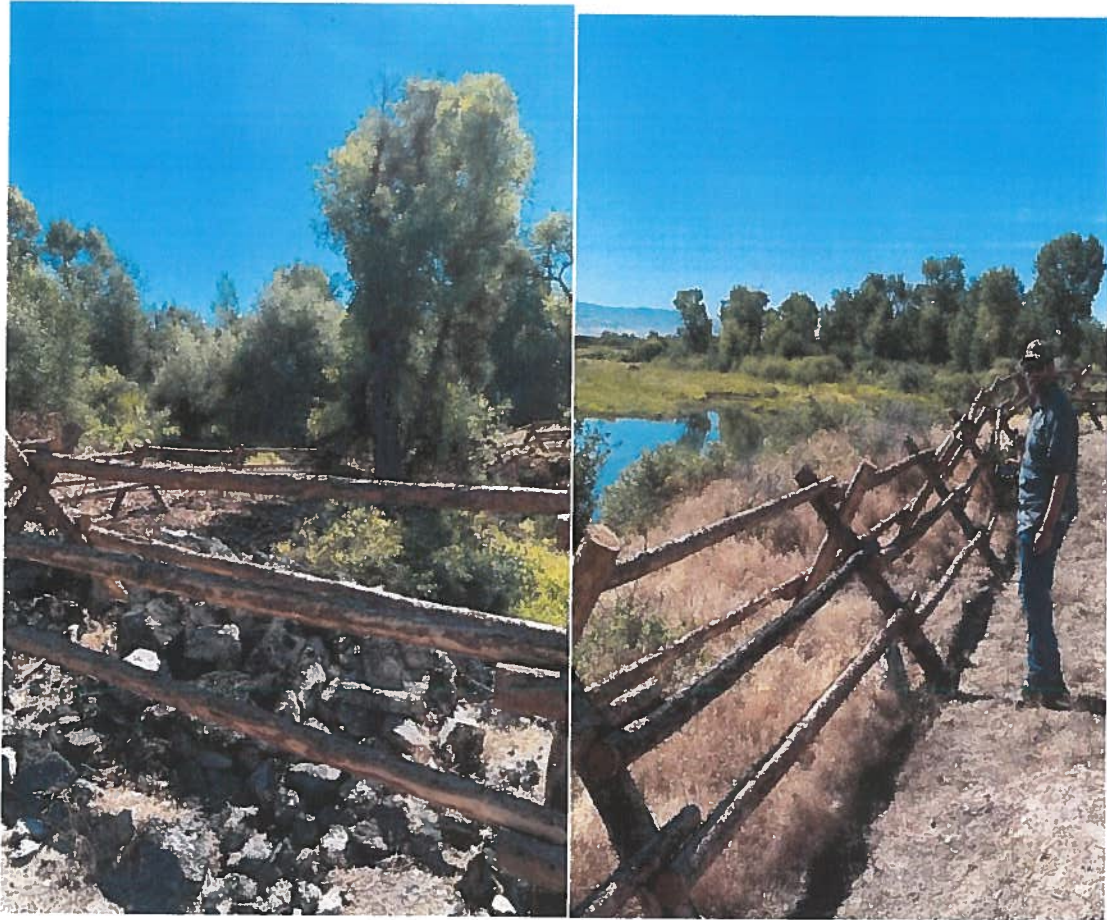
Fencing along the river in Springfield. The landowner had seen as many as 29 horses grazing on his wheat crop.