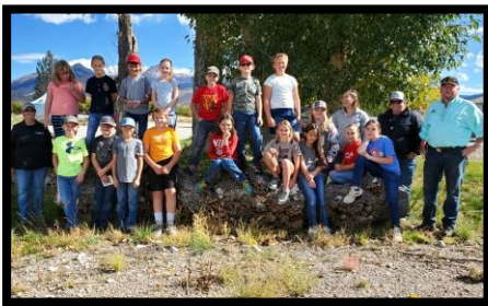
5 th Grade Tour Group and Presenters