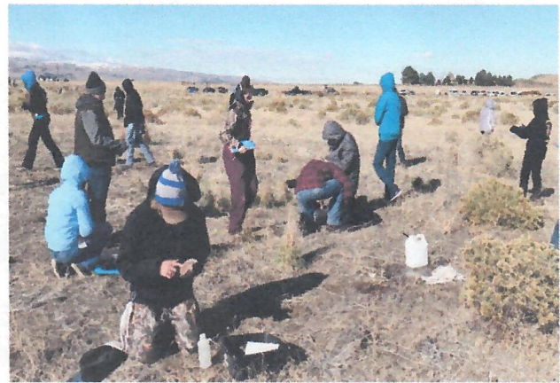
Idaho State Land & Soil Evaluation Event October 2021