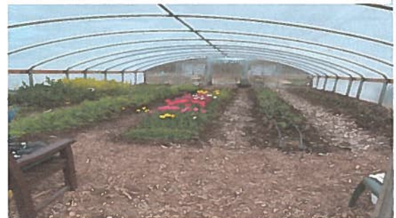
Inside High Tunnel with plants already growing