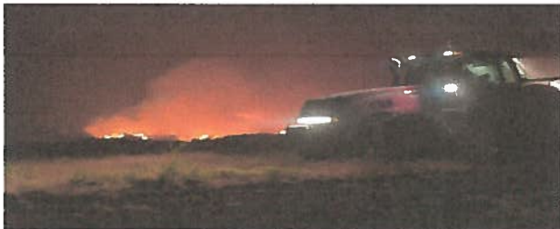
Henry Creek Fire 2016

The East Side SWCD will continue to support and work with Bonneville County on the newly established RFPA. The 9 th in the State of Idaho