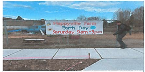
Starting off the day with gates open and staff Ready to start the tour of the farm

The East Side SWCD along with the West Side SWCD attended the Earth Day event at the Happyville High Tunnel Project, people were able to go thru the new High Tunnel and see how it is set up for planting, recording ground Temperature's inside, as well as outside Temperatures, and total operation controlled by solar panels.