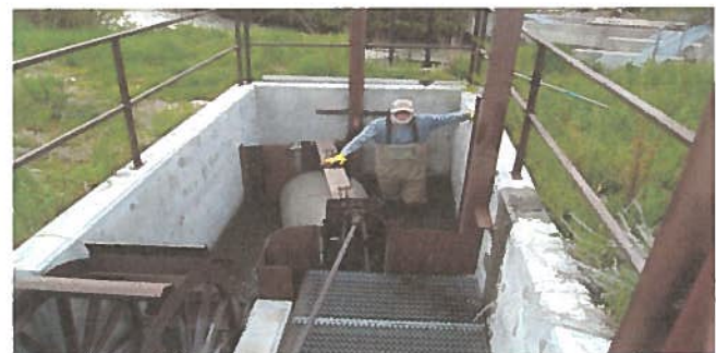
Modifying the irrigation diversion to allow fish to return to the stream and avoid being caught in the irrigation ditch. This is a typical drum screen installation, and how the project will look after completion.