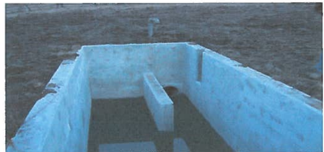
East and West in conjunction with the Snake River Cutthroats are partnering on a new fish screen project located in Swan Valley on Rainey Creek