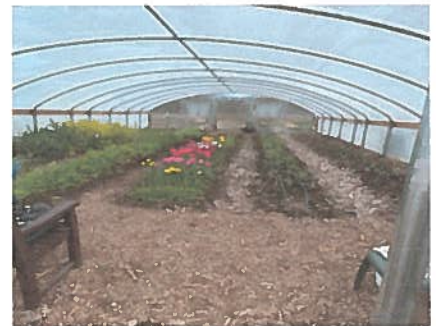
Inside the Tunnel with plants growing December 4th, 2021 Ribbon Cutting