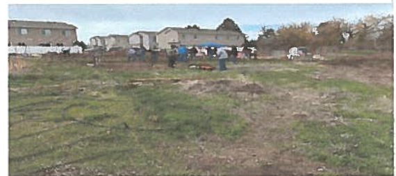
Touring the different areas and plots