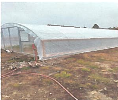
Frame work complete and covered

September 30, 2021 High Tunnel arrived and is starting to go up, Solar panels have been Installed and attached to batteries to provide power A Ribbon Cutting Ceremony was held on December 4 th , 2021, for the public to tour.