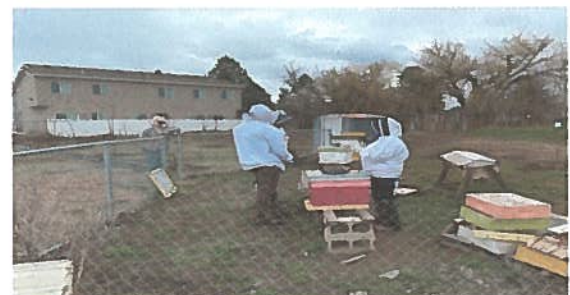
Checking the bee hives for the Queen, and how many survived the winter