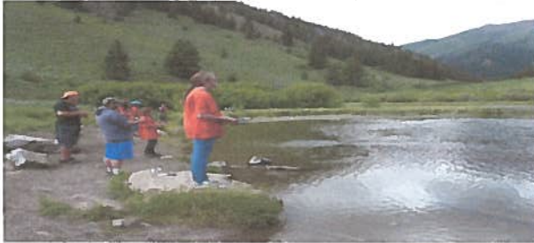
Learning to fish at Natural Resource Camp