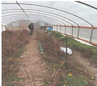
Tunnel fully enclosed