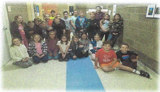
4 th grade students from Burton elementary attended a "birth of a river" conservation field trip