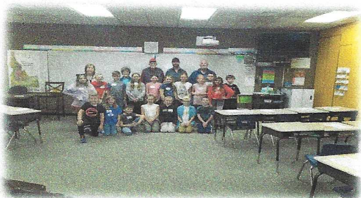
4 th grade students from Hibbard elementary attended a "birth of a river" conservation field trip sponsored by the Madison SWCD.