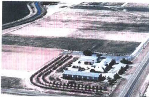
Results: Raised money to support the summer labor program and facilities at the Plant Materials Center.

The District is also pursuing a water conservation project with the Aberdeen-Springfield Canal Company.