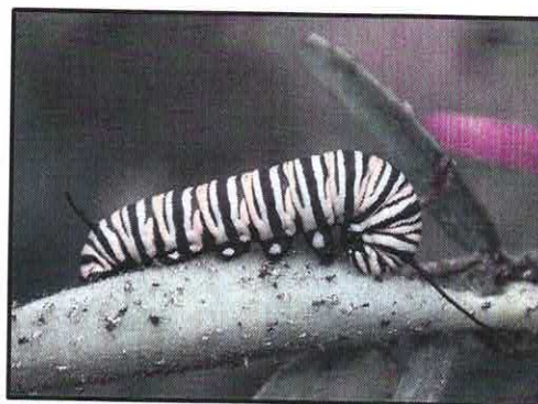
A Monarch Caterpillar on Milkweed similar to the habitat the SBSCD put in the Monarch Habitat.