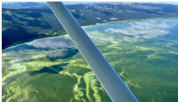
Aerial view of unusual June algal bloom determined to be non-toxic, though detected downstream in Horseshoe Bend drinking water. Toxic cyanobacteria 2022 fall bloom required IDEQ/CDH health advisory.