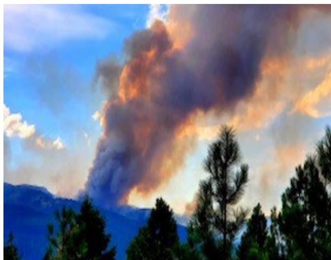
Four Corners Fire, south-end of Cascade reservoir, requires evacuations, threatens homes, IDEQ riparian fence project and delayed the IDEQ Source Water Protection septic pump-out pilot program with SLRWSD. District provides landowner contacts to set up Forest Service Fire Camp.

District NRCS Activities NRCS EQIP provided payments and contracted obligations for conservation practices implemented under eleven EQIP contracts totaling $102,203. These payments were made for forestry, high tunnel, and grazing best management practices. VSWCD continues to assist NRCS with EQIP project inquiries and landowner requests for technical/project assistance and receives administrative reimbursements.