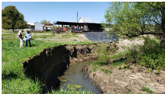
Project Along Hwy 95