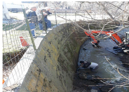
In City Limits Landowner Wall Breach