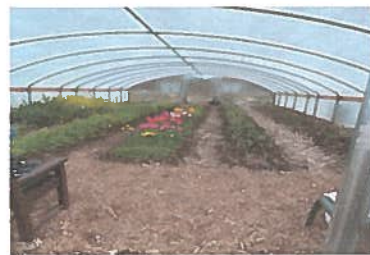
Inside the Tunnel with plants growing December 4th, 2021 Ribbon Cutting