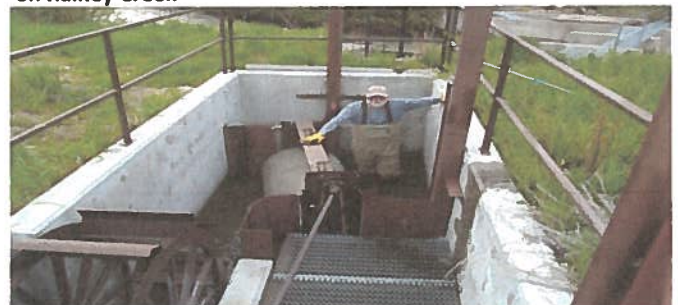
Modifying the irrigation diversion to allow fish to return to the stream and avoid being caught in the irrigation ditch. This is a typical drum screen installation, and how the project will look after completion.