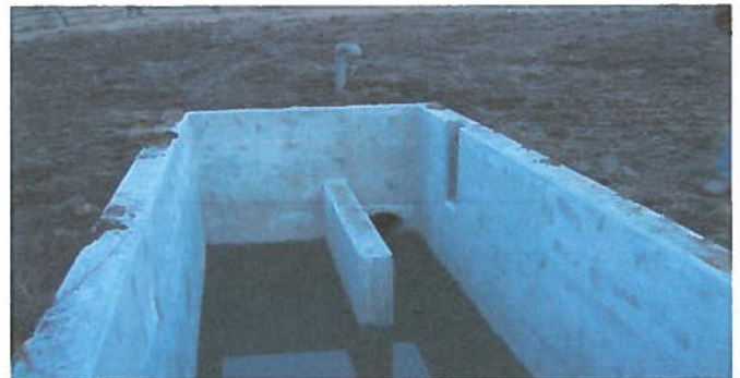
East and West in conjunction with the Snake River Cutthroats are Partnering on a new fish screen project located in Swan Vqalley on Rainey Creek