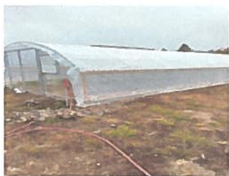
Frame work complete and covered

September 30, 2021 High Tunnel arrived and starting to go up, Solar panels have been Installed and attached to batteries to provide power A Ribbon Cutting Ceremony was held on December 4 th , 2021, for the public to tour.