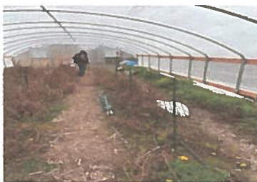
Tunnel fully enclosed