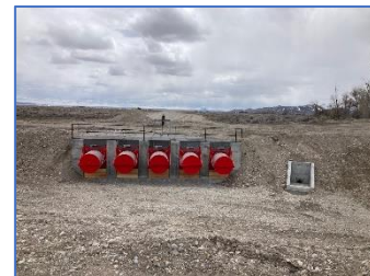
Fish Screens installed with District grant