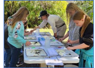
6 th Grade Natural Resources Tour

Foundation was used to conduct research on reducing evaporation in stockwater tanks.