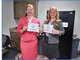
Speech Contest Winners