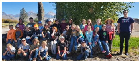
5 th Grade Students during the Conservation tour.

Providing action and information at the local level for promoting wise and beneficial conservation of natural resources with an emphasis on soil and water.