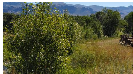
Garden Creek Wetland Mitigation Project 2023

An active youth information, education and outreach program will continue to be a focus of the Custer SWCD.