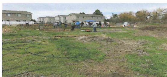
Touring the different areas and plots