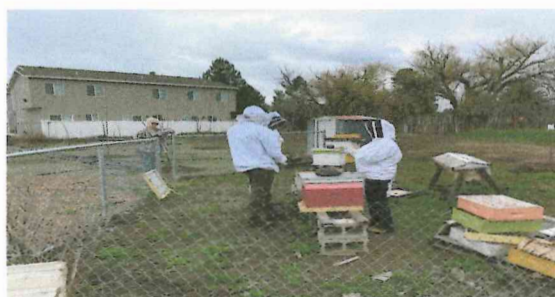
Checking the bee hives for the Queen, and how many survived the winter