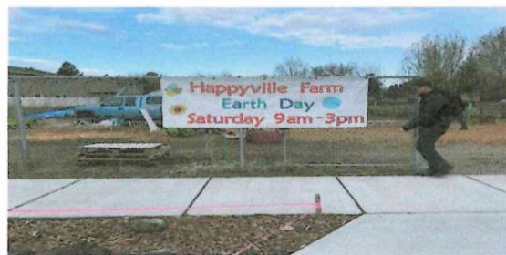
Starting off the day with gates open and staff Ready to start the tour of the farm

The East Side SWCD along with the West Side SWCD attended the Earth Day event at the Happyville High Tunnel Project, people were able to go thru the new High Tunnel and see how it is set up for planting, recording ground Temperature's inside, as well as outside Temperatures, and total operation controlled by solar panels.