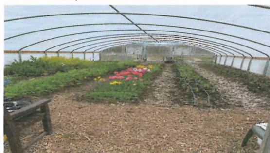
Inside High Tunnel with plants already growing