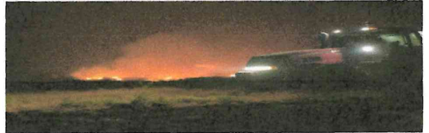
Henry Creek Fire 2016

The East Side SWCD will continue to support and work with Bonneville County on the newly established RFPA. The 9 th in the State of Idaho