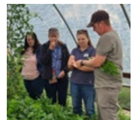
Sampling celery on Urban Ag High Tunnel tour.

In March 2023 a Russian Olive Control workshop and a field trip were sponsored by the district.