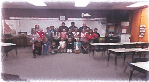
4 th grade students from Hibbard elementary attended a “birth of a river” conservation field trip sponsored by the Madison SWCD.