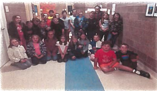
4 th grade students from Burton elementary attended a “birth of a river” conservation field trip