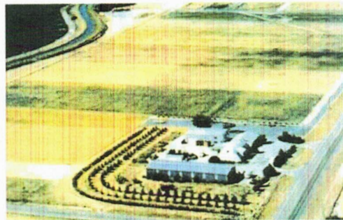
Results: Raised money to support the summer labor program and facilities at the Plant Materials Center.

The District is also pursuing a water conservation project with the Aberdeen-Springfield Canal Company.