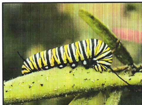
A Monarch Caterpillar on Milkweed similar to the habitat the SBSCD put in the Monarch Habitat.