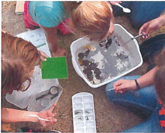
Annual 6 th Grade Field Day with over 220 students, teachers and volunteers.