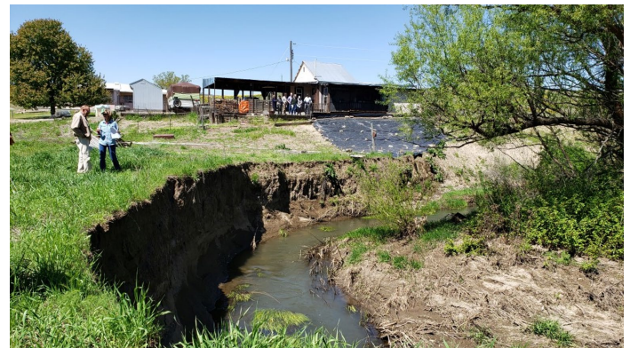
Monroe Creek Project Along Hwy 95