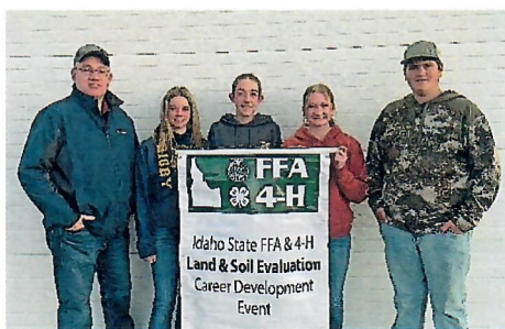
Rigby FFA - 2022 1 st Place Team