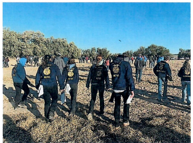
2022 Idaho State Land & Soil Evaluation Event

West Cassia partnered with the Idaho State Department of Agriculture for the 6 th year to run The Cotterell Invasive Species Watercraft Inspection Station . The station runs on a calendar year, they opened on March 6, 2023. As of December 10, 2023, they inspected a total of 5,441 water craft, of which 367 came from infested waters. They hot-washed 215 water craft. Law enforcement returned 441 drive-by boats and assisted in keeping our employees safe. The district was responsible for day-to-day operations at the station, managing employees, finances and payroll. As of December 1, 2023 the district has received $21,481.36 in administrative funds from the project.