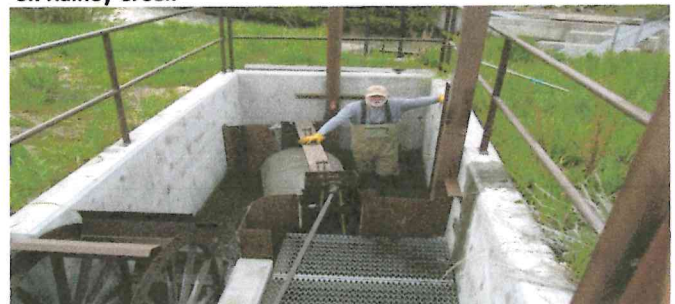
Modifying the irrigation diversion to allow fish to return to the stream and avoid being caught in the irrigation ditch. This is a typical drum screen installation , and how the project will look after completion.