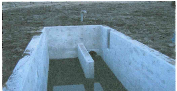
East and West in conjunction with the Snake River Cutthroats are Partnering on a new fish screen project located in Swan Vqalley on Rainey Creek