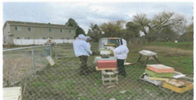
Checking the bee hives for the Queen, and how many survived the winter