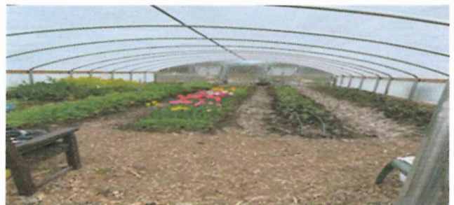
Inside High Tunnel with plants already growing