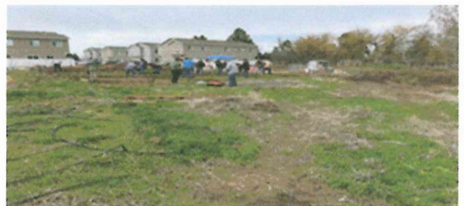
Touring the different areas of the farm and plots