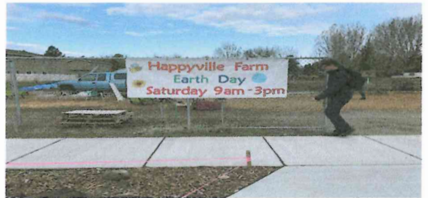
Starting off the day with gates open and staff Ready to start the tour of the farm

The East Side SWCD along with the West Side SWCD attended the Earth Day event at the Happyville High Tunnel Project, people were able to go thru the new High Tunnel and see how it is set up for planting, recording ground Temperature's inside, as well as outside Temperatures, and total operation controlled by solar panels