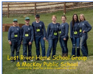
District sponsored Envirothon Team