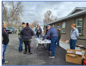
Arbor Day Activity