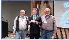
Speech contest winner