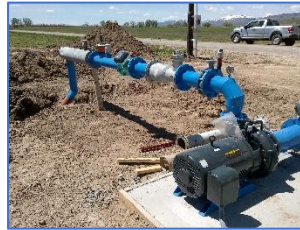
NRCS funded irrigation improvements