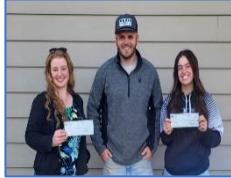
High School Scholarship Winners