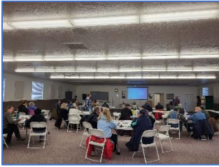
Educational public meeting