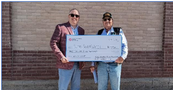
Accepting urban gardener grant award