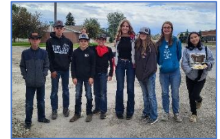
Natural Resource Camp Scholarship Recipients