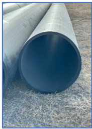
Pipeline installed with District grant