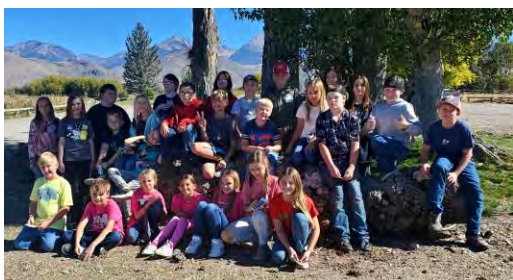
5 th Grade Students during the Conservation tour.

Providing action and information at the local level for promoting wise and beneficial conservation of natural resources with an emphasis on soil and water.