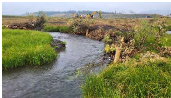
Pole Creek Stream Complexity Project 2024

An active youth information, education and outreach program will continue to be a focus of the Custer SWCD.