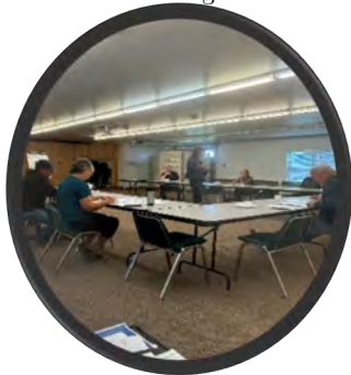
Representatives from Idaho Fish and Game University of Idaho Gooding Extension , Camas and Gooding Soil Conservation Districts were all in attendance