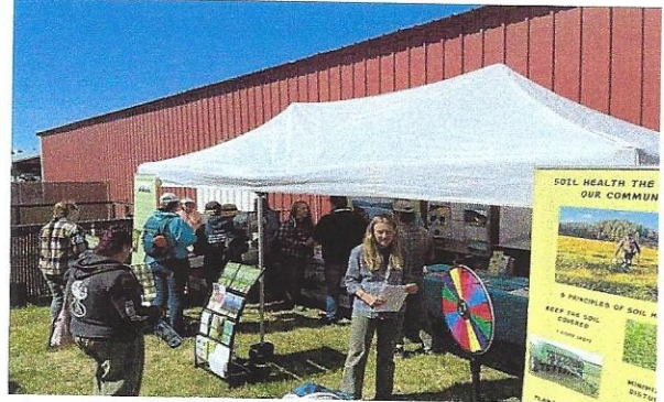
This is the vendor booth that introduces the conservation districts as well as educates new landowners moving into the area. We also had a prize wheel for the kids.