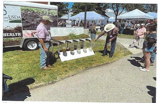
This is the soil demonstration that shows water infiltration and runoff based on different soil health practices.

The District participated in the 1 st and 2 nd Annual Modern Homesteading Event held at the Kootenai County Fairgrounds in June 2023 and 2024. The District partnered with Bonner County SWCD and NRCS to do a full soil health demonstration. The event was a huge success and looking forward to the 2025 Event.