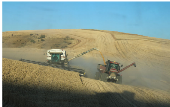
Harvest on the Palouse

*The above represents the Latah SWCD’s grant and contract income within FY24. A total of 11 new grants and contracts were awarded in FY24 totaling ~ $1,950,000 to be expended over the next several years. These FY24 project funds continue to support the Latah SWCD Board of Supervisors’ capacity to fulfill the local governance leadership role outlined in the attached mission statement.