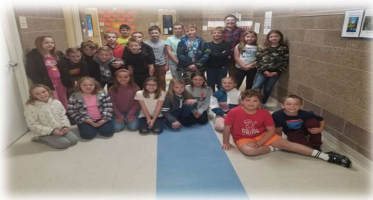
4 th grade students from Burton elementary attended a “birth of a river” conservation field trip