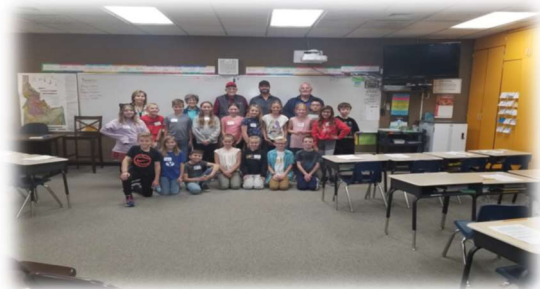
4 th grade students from Hibbard elementary attended a “birth of a river” conservation field trip sponsored by the Madison SWCD.