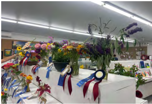
Winner of Payette SWCD Pollinator Flower Arrangement