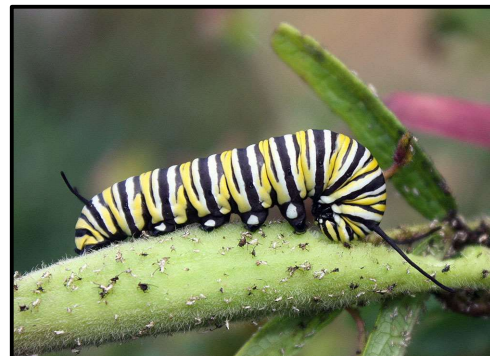
A Monarch Caterpillar on Milkweed similar to the habitat the SBSCD put in the Monarch Habitat.