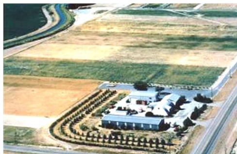
Results: Raised money to support the summer labor program and facilities at the Plant Materials Center.

The District is also pursuing a water conservation project with the Aberdeen-Springfield Canal Company.