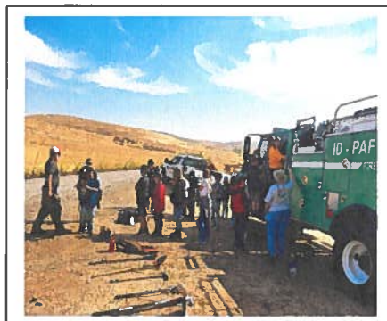
Payette Forest Service presenting safety education to students