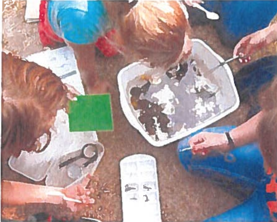
Annual Middle School Field Day with over 220 students, teachers and volunteers.