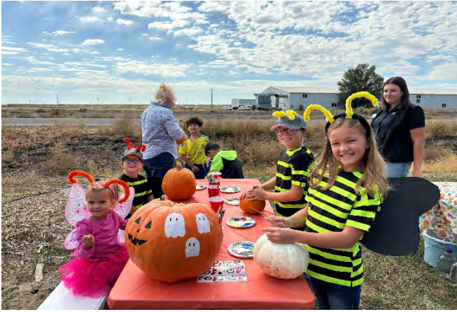
Pumpkin Painting at the Festival!