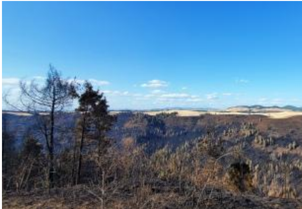
Figure 2. Bedrock Fire Burn Area