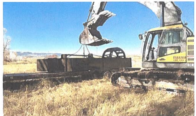
Getting ready to set new equipment in place of old one removed