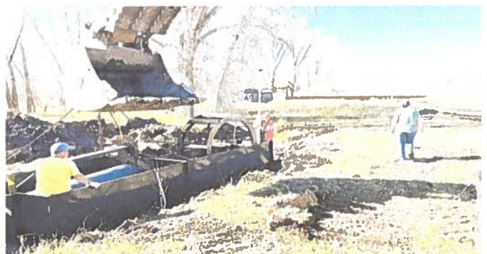
Installing new Diversion equipment, with updated screens And fish returns