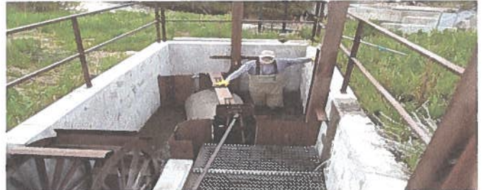
This is a typical drum screen installation, and is being replaced with a more modern and efficient system

East and West in conjunction with the Snake River Cutthroats are Partnering on a new fish screen project located in Swan Valley on Rainey Creek