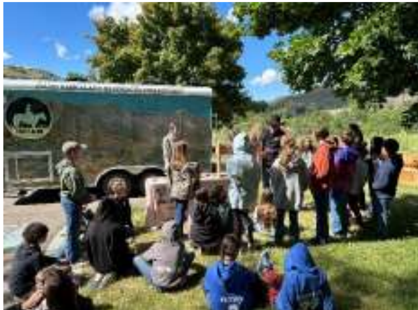
Outdoor School at Black Canyon Dam for fifth grade students.