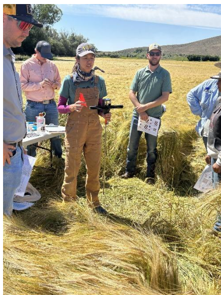
Above: Field day tour at Picabo livestock Barely fields.