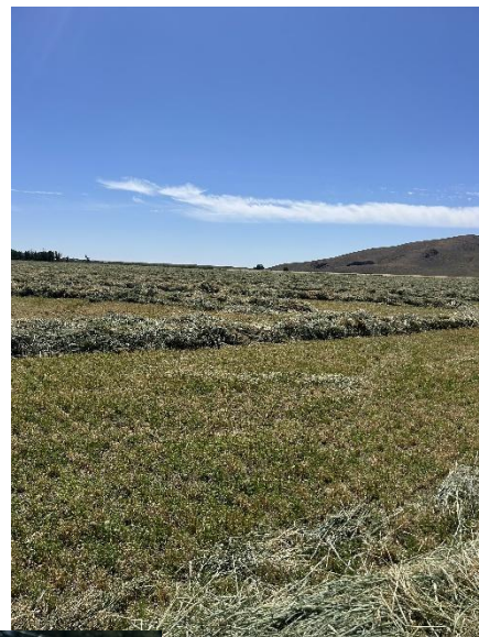
Below Left: Showing the healthy soil and root health from the barley field used in the Field Day.