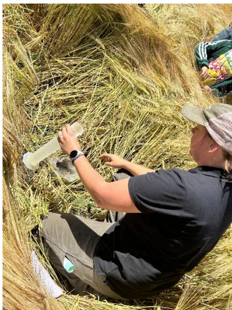
Below Left: NRCS Soil Health Trailer using 5 soils from around the Picabo and lower Big wood area.