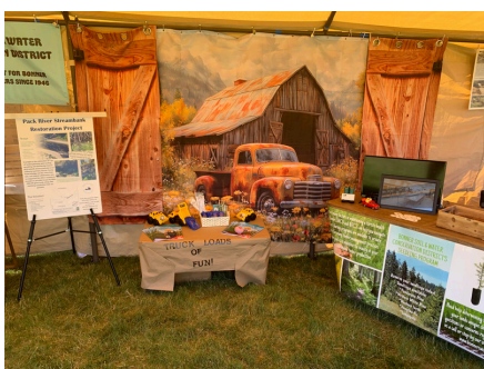
Bonner SWCD Fair Display

Bonner SWCD staff and board members participated in public outreach events this year including the Bonner County Fair, Ponderay Days, Timber Days, Selkirk – Pend Oreille Food Summit, Homesteader Conference, Girl Scouts tree planting event, and the Conservation District Legislative display in Boise. Bonner SWCD received first place in their display at the Bonner County Fair. These events further strengthened and resulted in new community partnerships.