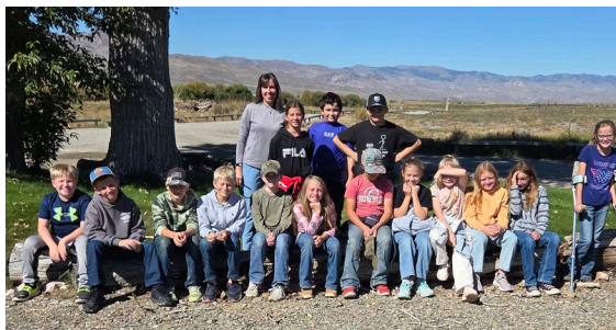
5 th Grade Students during the Conservation tour.