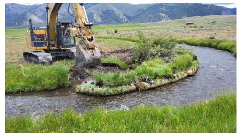
Pole Creek placement of coir logs to narrow channel

An active youth information, education and outreach program will continue to be a focus of the Custer SWCD.