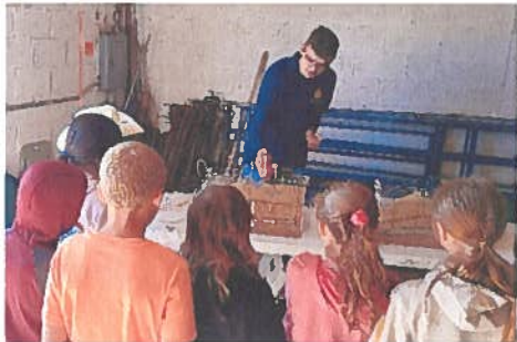
Ground water movement demo at Rigby FFA 3 rd grade Ag Days water cycle station.

One registration was paid by the district for a youth leader attendee at University of Idaho Natural Resource Camp in June 2025.