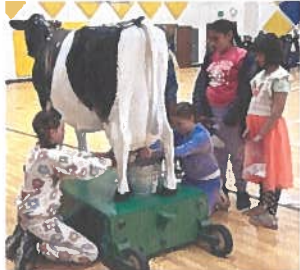
Dolly visited many 4 th graders during DUP 4 th Grade History Fairs and the Mud Lake Museum/DUP History Day .

Dolly the Idaho Dairy Cow visited the Mud Lake Fair and the Rigby Fair in August 2024. With a display of district activities, NRCS and FSA programs were also promoted.