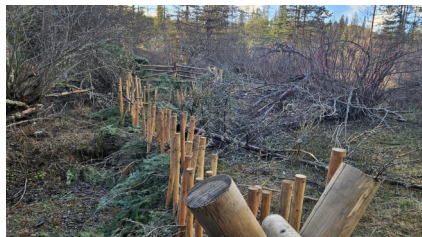
Beaver dam analog

*The above represents Latah SWCD grant and contract income within FY25. A total of 6 new grants and contracts were awarded in FY25 totaling ~$850,000 to be expended over the next several years.