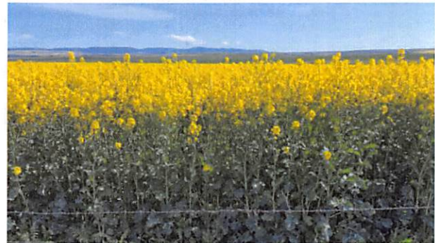
Figure 1. Canola seeded for conservation crop rotation.