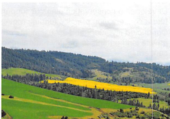
Figure 2. Lapwai Creek watershed.