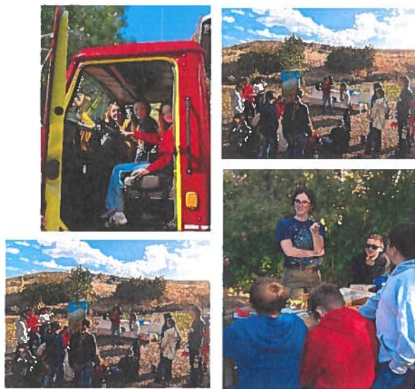
Middle School Field Day with over 225 volunteers, students and teachers