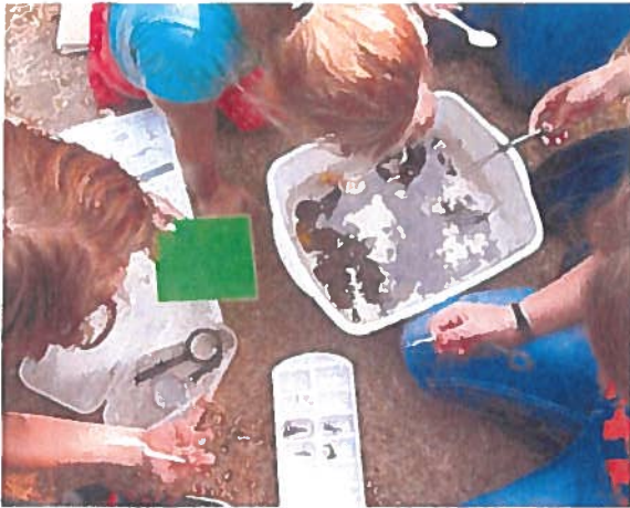
Annual Middle School Field Day with over 220 students, teachers and volunteers.